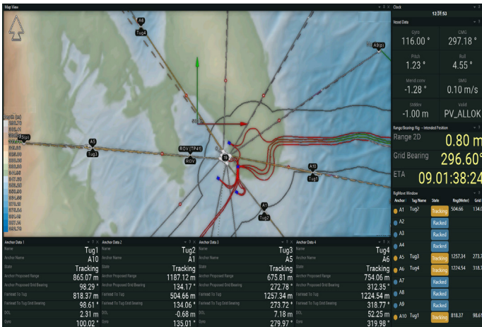
iNAV® - Helmsman's Display

At the heart of every iNAV® installation lies the Eiva NaviPac online navigation software, part of the Eiva software suite. This software can easily be configured on-the-fly for single or multi-vessel operations (tug management), and is scalable to include numerous additional marine assets.