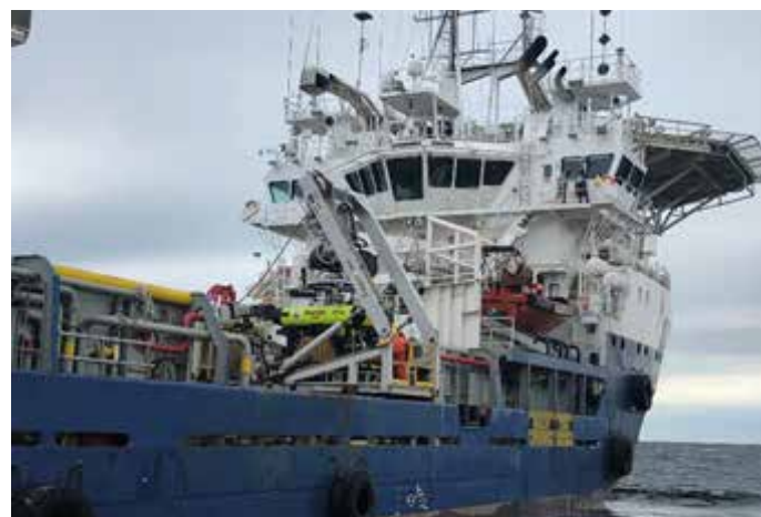
M/V Topaz Commander

The cables cross the shipping channel separating the Anatolian and European landfalls each side of the Sea of Marmara. Each cable crosses four existing cables with each crossing protected by Rock Berms.