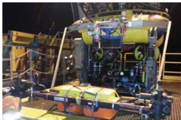
Cable Tracker Installation on the Merlin WROV

The cables cross the shipping channel separating the Anatolian and European landfalls each side of the Sea of Marmara. Each cable crosses four existing cables with each crossing protected by Rock Berms.