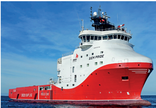
MV Siem Pride

iSURVEY AS, together with IKM Subsea AS and the vessel charterer, were contracted by Norske Shell to provide the Siem Pride, fully equipped with survey spread and ROV, to conduct the Annual Pipeline Inspection program of the Ormen Lange 120km gas export pipeline. The survey also included inspection of umbilicals and spool pieces between near-shore Nyhamna, Norway to the Ormen Lange field.